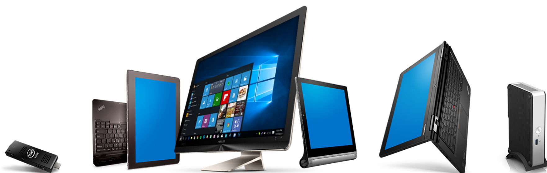
Intel® Compute Stick

Right device at the right time | More choice