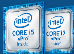
6th gen Intel® Core™ vPro™ processor family