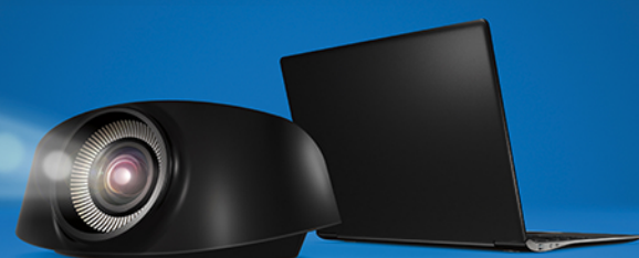
Intel® Pro Wireless Display