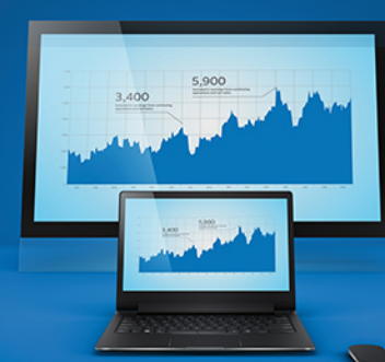
Intel® Wireless Docking